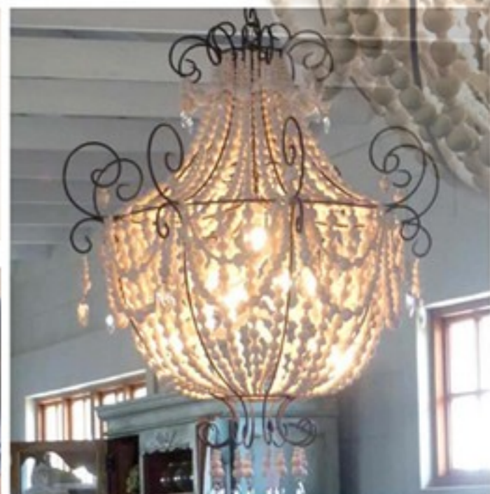
CLASSIC Large Chandelier