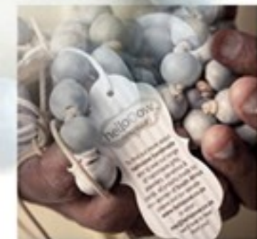
Full Bead Necklace on thong

or call us, we'd love to hear from you - Merewyn de Heer : + 27 82 465 1845