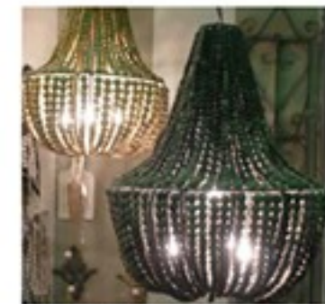
Less is More : LIM