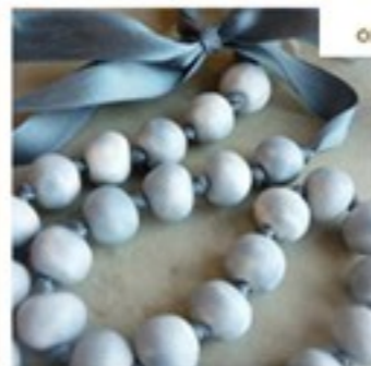
Full Bead Necklace on ribbon