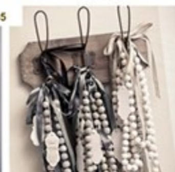
Ceramic bead necklaces