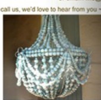
Teardrop Classic Chandelier