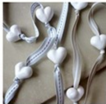
Ribbon Heart Necklace