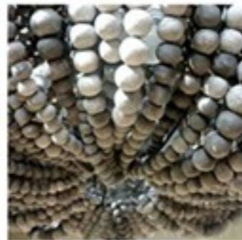
LIM - detail